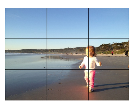
Using the rule of thirds

When composing an image the Rule of Thirds is worth considering. This splits the image up into 9 sections and says that you should aim to place the key objects in the image on one of the thirds.