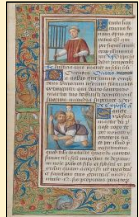
French manuscript - 1500s