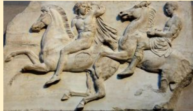
Part of the Parthenon Frieze, Athens - BCE c. 440