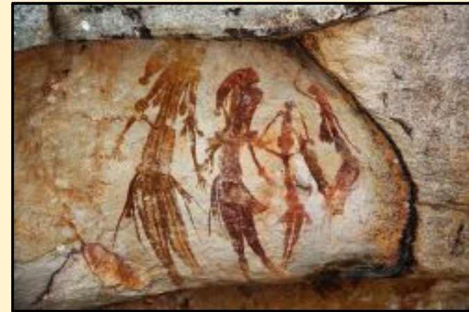
Gwion Gwion rock paintings, Australia - 12,000 years old