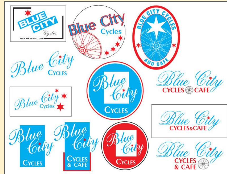
Image from Mike Rohde on Flickr . Using a creative commons attribution non-commercial license

Both of these examples need more annotation and to consider colour more obviously