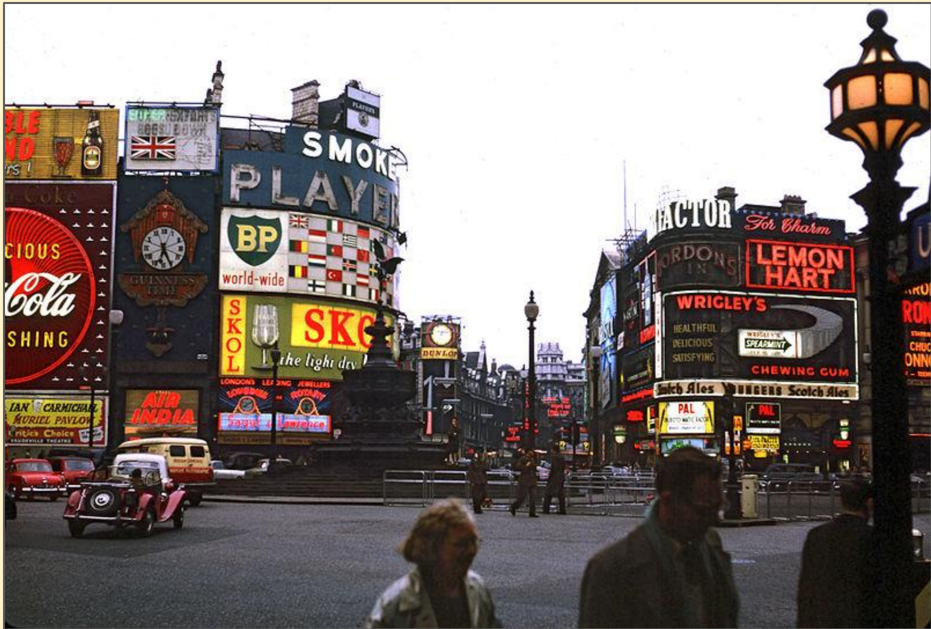
Piccadilly Circus in 1962 3