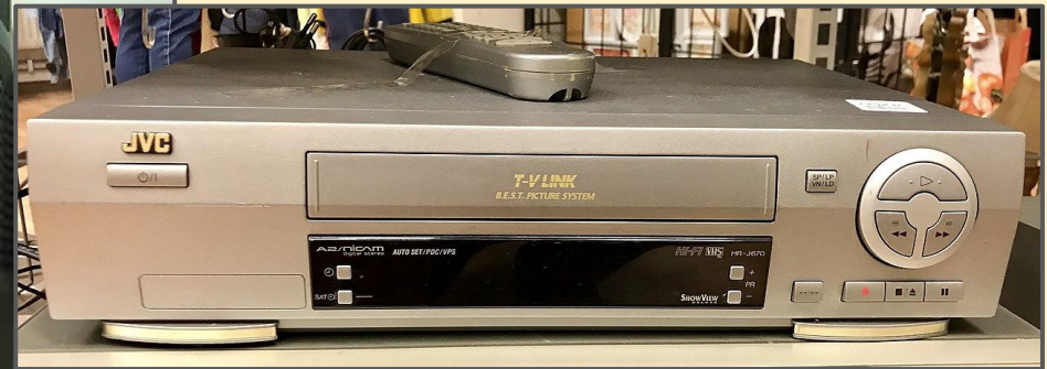
1990s TV; 2000s VCR 7