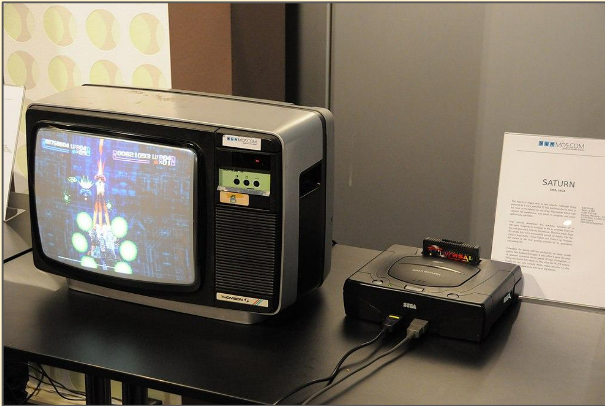
1990s game console and TV

What about other areas of the media industry?