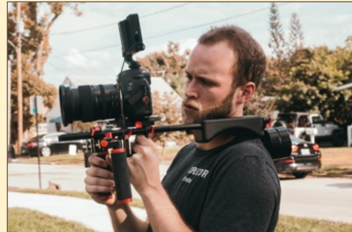
Camera operators use storyboards to know what to film and how to film it