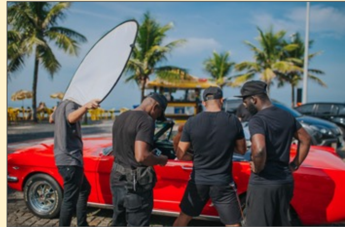
Filming requires a lot of people and equipment.